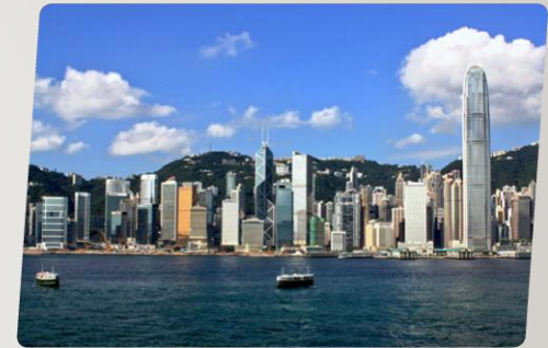
Hong Kong, SAR Covers South China

“Being there is everything.” This is particularly important in China, where great value is placed on interpersonal relationships.