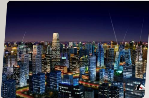
Beijing The Political Centre