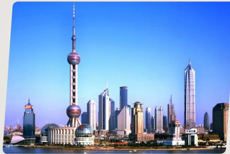
Shanghai The Economic Centre